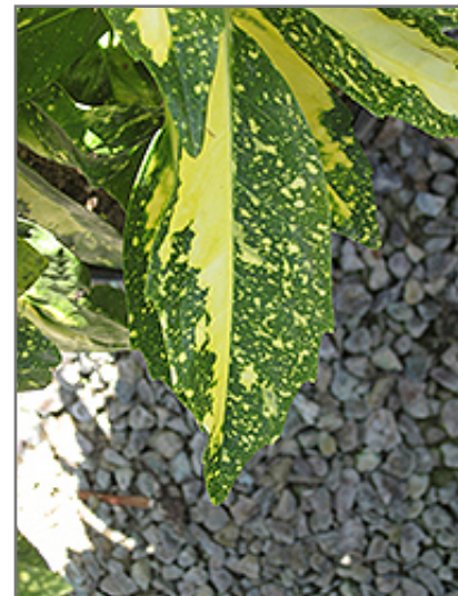
Variegated Japanese Aucuba foliage