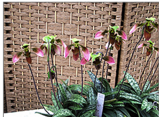
Appleton's Orchid in bloom