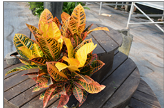
Variegated Croton