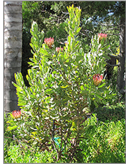
Sylvia Protea in bloom

This shrub should only be grown in full sunlight. It is very adaptable to both dry and moist growing conditions, but will not tolerate any standing water. It is not particular as to soil type, but has a definite preference for acidic soils. It is somewhat tolerant of urban pollution, and will benefit from being planted in a relatively sheltered location. Consider applying a thick mulch around the root zone in winter to protect it in exposed locations or colder microclimates. This particular variety is an interspecific hybrid.