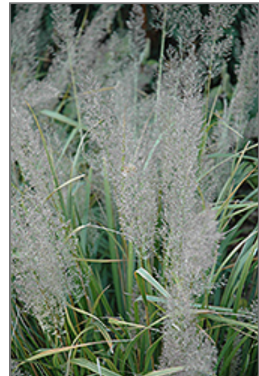
Korean Reed Grass fruit