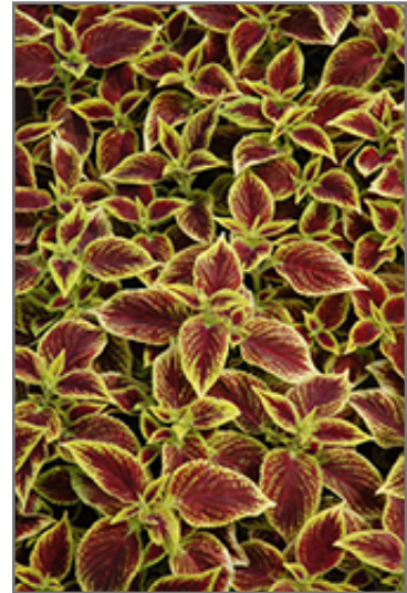
Crimson Gold Coleus foliage

Crimson Gold Coleus is recommended for the following landscape applications;