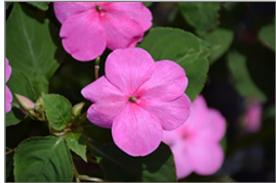
Lollipop Bubblegum Pink Impatiens flowers

Lollipop Bubblegum Pink Impatiens is recommended for the following landscape applications;