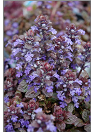
Bronze Beauty Bugleweed flowers

Bronze Beauty Bugleweed is recommended for the following landscape applications;