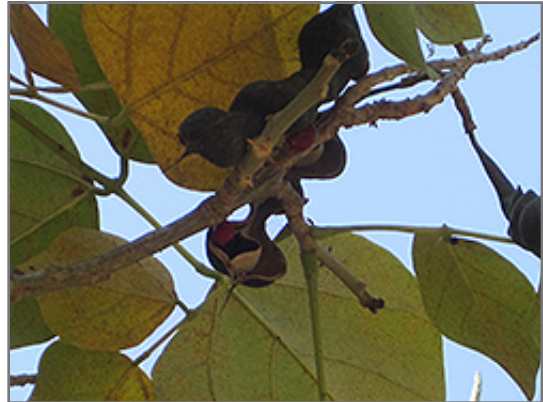
Pito Coral Tree fruit

This tree should only be grown in full sunlight. It prefers dry to average moisture levels with very well-drained soil, and will often die in standing water. It is considered to be drought-tolerant, and thus makes an ideal choice for xeriscaping or the moisture-conserving landscape. It is not particular as to soil type or pH. It is somewhat tolerant of urban pollution. Consider applying a thick mulch around the root zone in winter to protect it in exposed locations or colder microclimates. This species is not originally from North America, and parts of it are known to be toxic to humans and animals, so care should be exercised in planting it around children and pets.