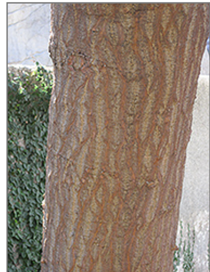
Pito Coral Tree bark