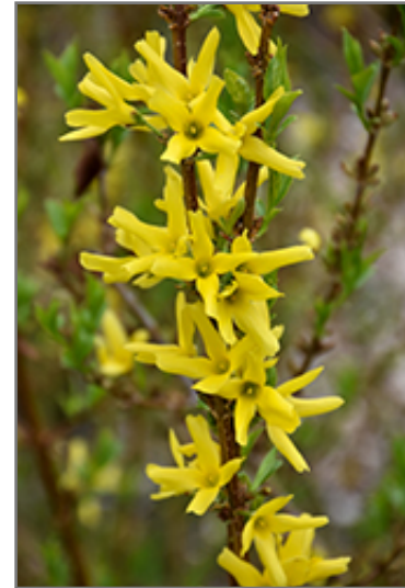
Bronx Forsythia flowers

Bronx Forsythia is recommended for the following landscape applications;