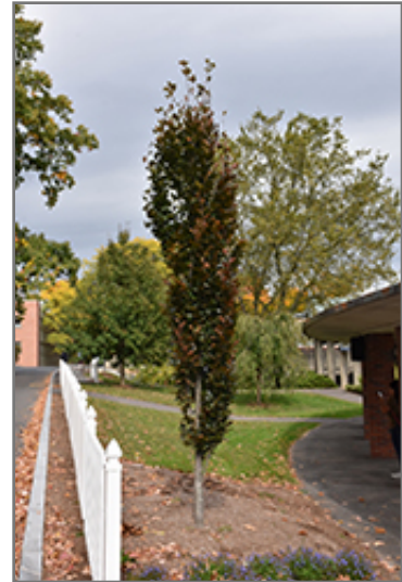
Dawyck Purple Beech