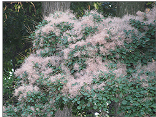
American Smoketree in bloom