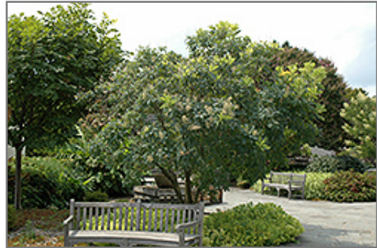
American Smoketree in bloom

American Smoketree is recommended for the following landscape applications;