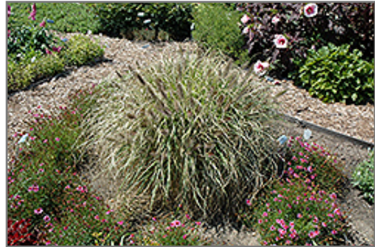
Ginger Love Fountain Grass

Ginger Love Fountain Grass is recommended for the following landscape applications;