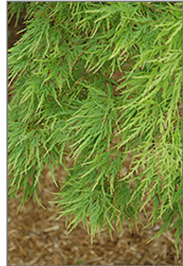
Cutleaf Japanese Maple foliage

Cutleaf Japanese Maple is recommended for the following landscape applications;