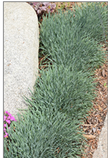
Blue Eddy Ornamental Onion