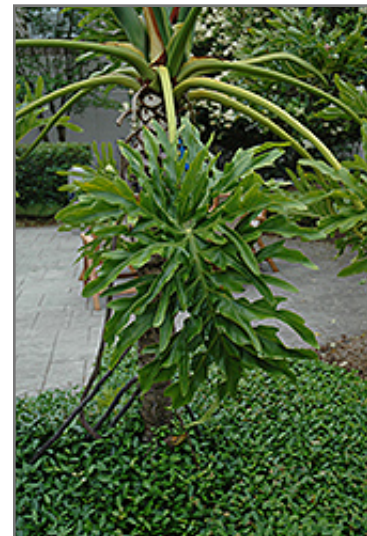
Tree Philodendron foliage