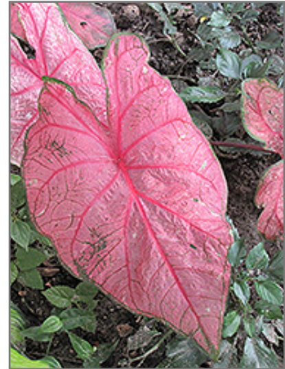
Fannie Munson Caladium foliage

Fannie Munson Caladium is recommended for the following landscape applications;