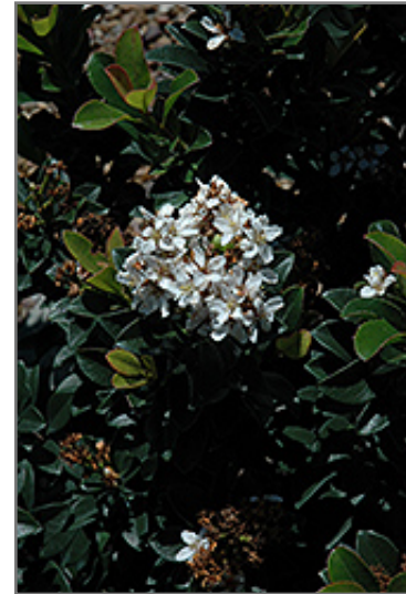
Snow White Indian Hawthorn flowers