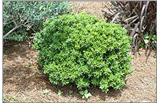
Oscar's Dwarf Yaupon Holly

Oscar's Dwarf Yaupon Holly is recommended for the following landscape applications;