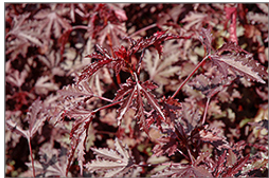
Haight Ashbury Hibiscus foliage