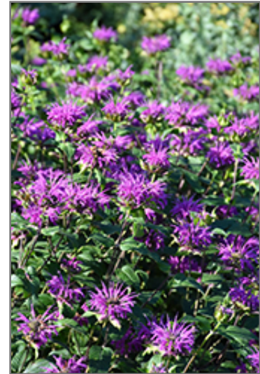
Dark Ponticum Beebalm flowers