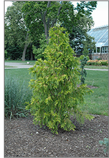
Canadian Gold Red Cedar