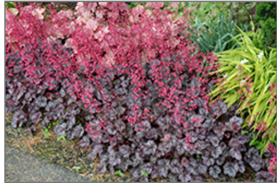
Glitter Coral Bells in bloom

This is a relatively low maintenance plant, and should be cut back in late fall in preparation for winter. It is a good choice for attracting hummingbirds to your yard. It has no significant negative characteristics.