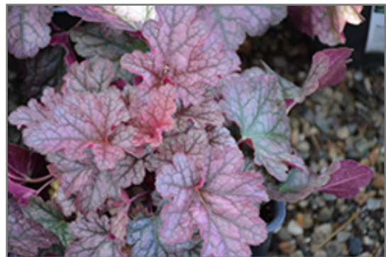
Kira Purple Rain Forest Coral Bells foliage