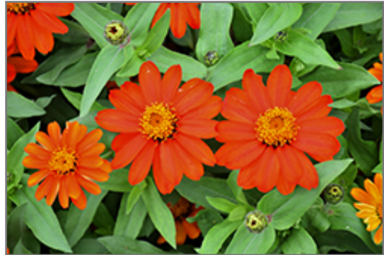
Zahara Fire Zinnia flowers

Zahara Fire Zinnia is recommended for the following landscape applications;