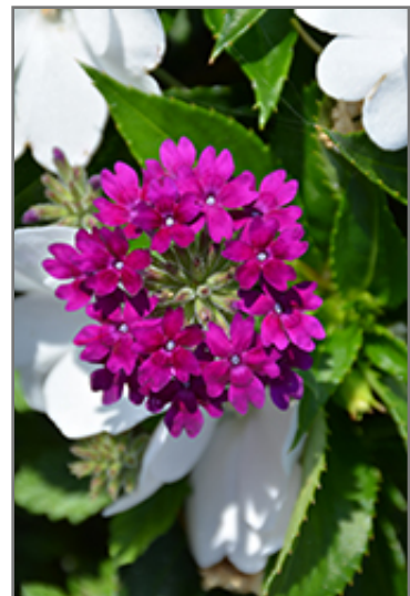
Superbena Royale Plum Wine Verbena flowers