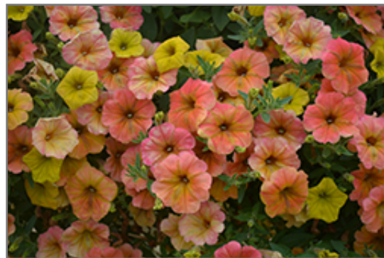
Cascadias Indian Summer Petunia flowers