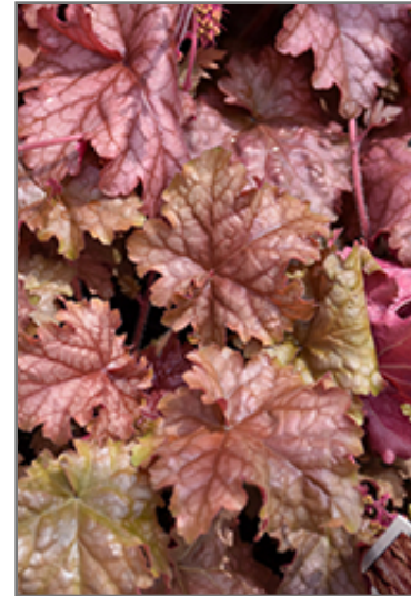
Carnival Peach Parfait Coral Bells foliage

Carnival Peach Parfait Coral Bells is recommended for the following landscape applications;