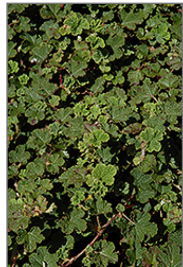
Formosan Carpet Creeping Taiwan Bramble foliage