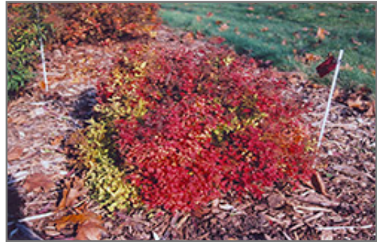
Dakota Goldcharm Spirea in fall

This shrub should only be grown in full sunlight. It prefers to grow in average to moist conditions, and shouldn't be allowed to dry out. It is not particular as to soil type or pH. It is highly tolerant of urban pollution and will even thrive in inner city environments. This is a selected variety of a species not originally from North America.