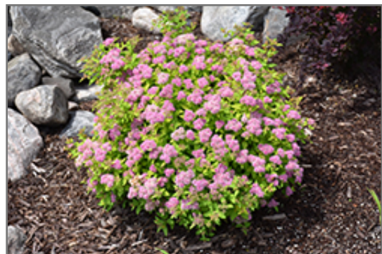
Dakota Goldcharm Spirea in bloom