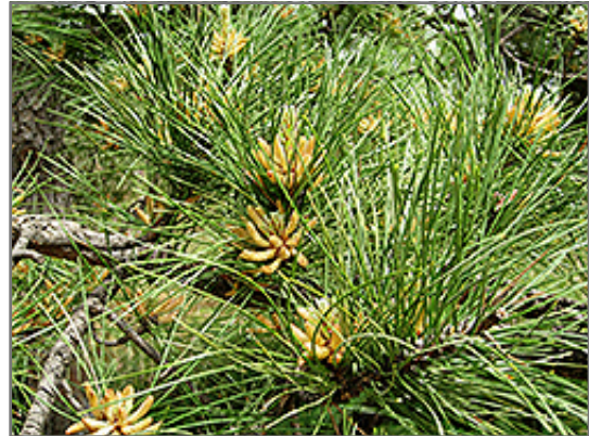
Chinese Red Pine foliage

This tree should only be grown in full sunlight. It prefers dry to average moisture levels with very well-drained soil, and will often die in standing water. It is considered to be drought-tolerant, and thus makes an ideal choice for xeriscaping or the moisture-conserving landscape. It is not particular as to soil type or pH. It is highly tolerant of urban pollution and will even thrive in inner city environments. This species is not originally from North America.