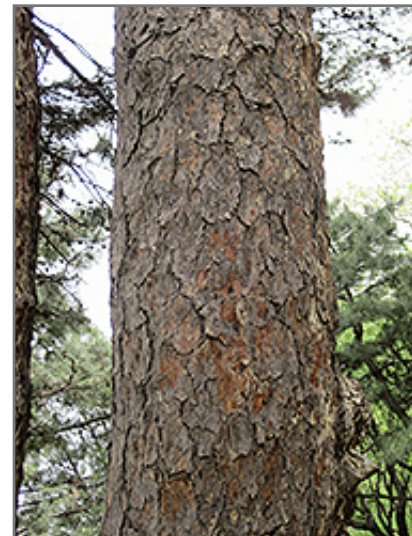
Chinese Red Pine bark