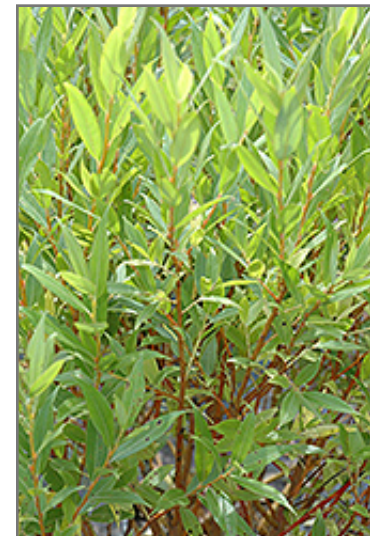
Flame Willow foliage