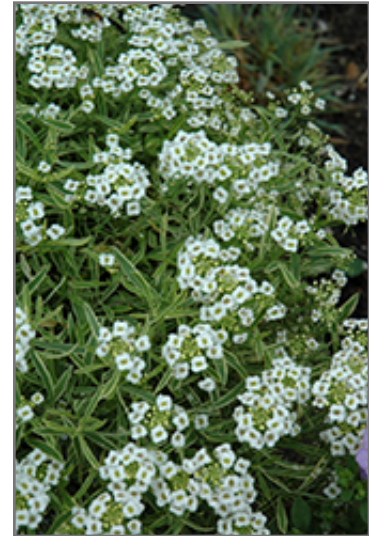
Frosty Knight Alyssum flowers

This plant will require occasional maintenance and upkeep, and should not require much pruning, except when necessary, such as to remove dieback. It is a good choice for attracting bees and butterflies to your yard, but is not particularly attractive to deer who tend to leave it alone in favor of tastier treats. It has no significant negative characteristics.