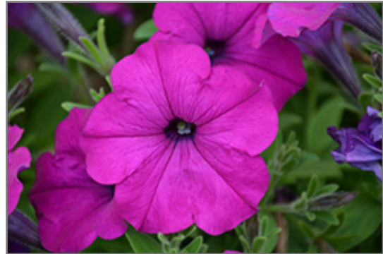
Easy Wave Violet Petunia flowers

This plant will require occasional maintenance and upkeep. Trim off the flower heads after they fade and die to encourage more blooms late into the season. It is a good choice for attracting bees and hummingbirds to your yard, but is not particularly attractive to deer who tend to leave it alone in favor of tastier treats. It has no significant negative characteristics.