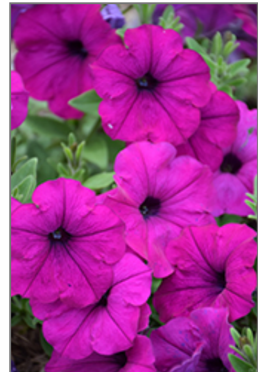
Easy Wave Violet Petunia flowers