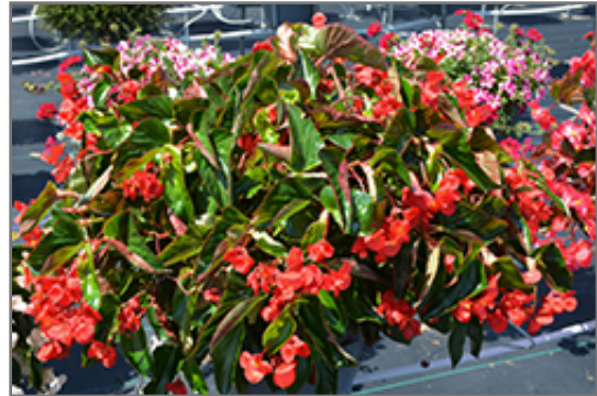
Dragon Wing Red Begonia in bloom

Dragon Wing Red Begonia is a fine choice for the garden, but it is also a good selection for planting in outdoor containers and hanging baskets. Because of its trailing habit of growth, it is ideally suited for use as a 'spiller' in the 'spiller-thriller-filler' container combination; plant it near the edges where it can spill gracefully over the pot. Note that when growing plants in outdoor containers and baskets, they may require more frequent waterings than they would in the yard or garden.