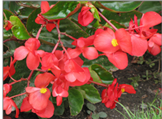
Dragon Wing Red Begonia flowers

Dragon Wing Red Begonia is an herbaceous annual with a trailing habit of growth, eventually spilling over the edges of hanging baskets and containers. Its medium texture blends into the garden, but can always be balanced by a couple of finer or coarser plants for an effective composition.