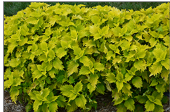
Wasabi Coleus