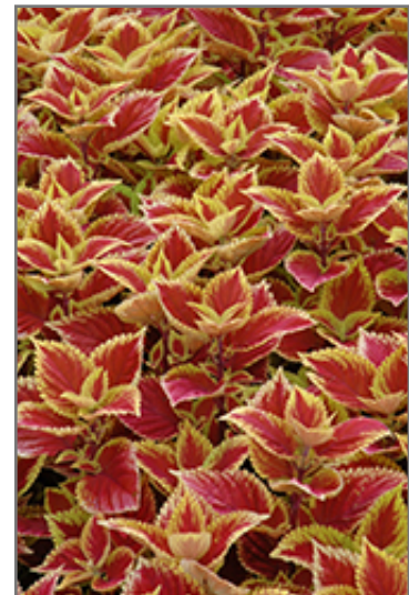
Trusty Rusty Coleus foliage