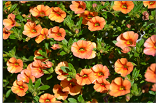
Can-Can Apricot Calibrachoa flowers

Can-Can Apricot Calibrachoa is recommended for the following landscape applications;