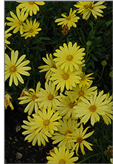
Voltage Yellow African Daisy flowers