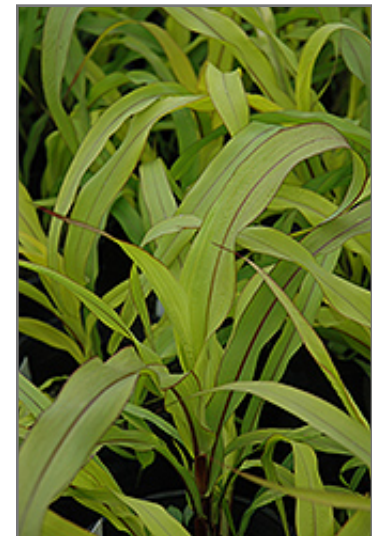
Jester Millet foliage