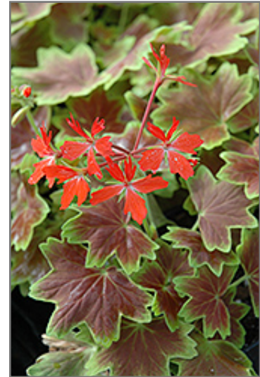
Vancouver Centennial Geranium flowers