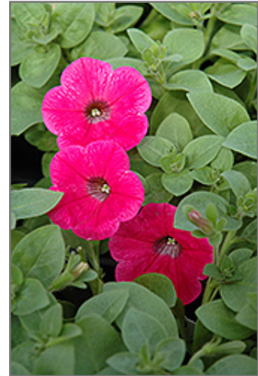
Piccola Hot Pink Petunia flowers