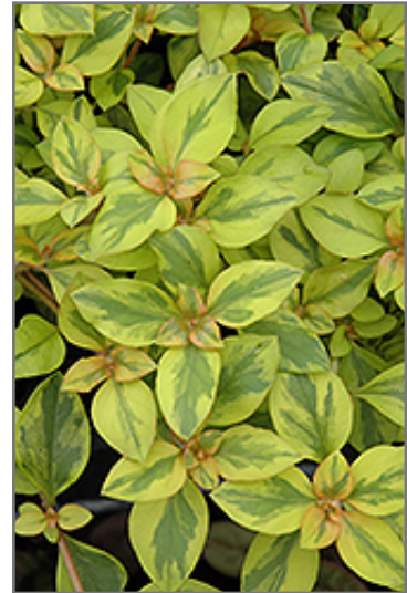
Walkabout Sunset Loosestrife foliage

Walkabout Sunset Loosestrife is recommended for the following landscape applications;