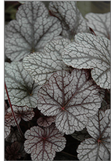
Prince Of Silver Coral Bells foliage