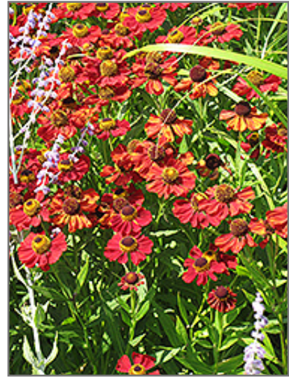
Rubinzweg Sneezeweed in bloom

Rubinzweg Sneezeweed is recommended for the following landscape applications;