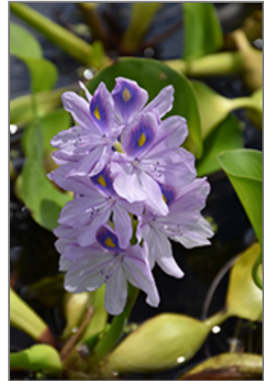
Water Hyacinth flowers

Water Hyacinth is ideally suited for growing in a pond, water garden or patio water container, and is recommended for the following landscape applications;