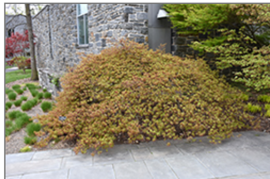
Spring Delight Japanese Maple