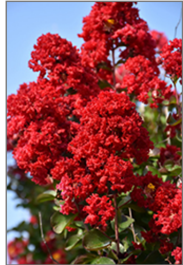
Dynamite Crapemyrtle flowers