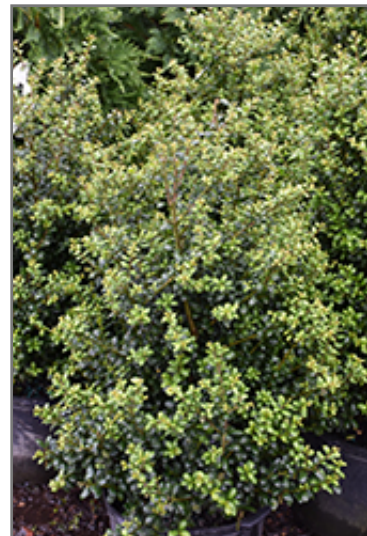
Chesapeake Japanese Holly