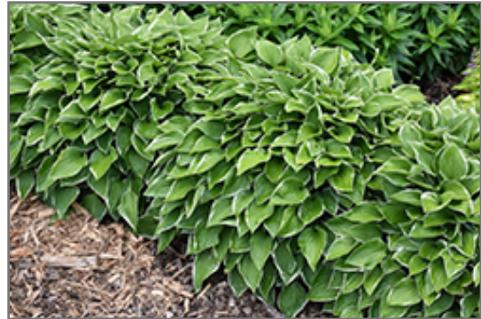
Allan P. McConnell Hosta

Allan P. McConnell Hosta is recommended for the following landscape applications;