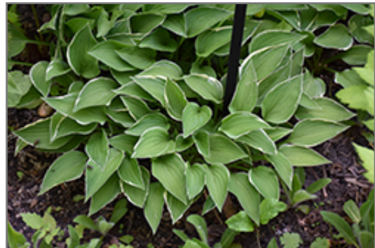
Allan P. McConnell Hosta foliage